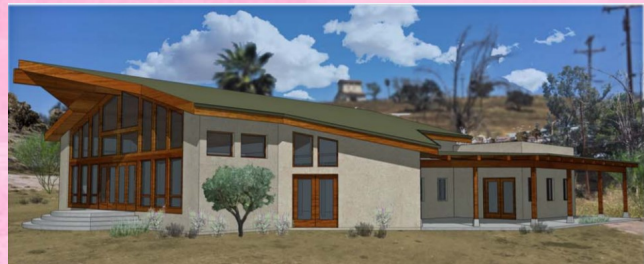
3D Rendering of Proposed Church, Hubbell & Hubbell Architects

the siting of the church. Two entrances are shown: one from the Green, that opens into the altar area, as well as an entrance from the side patio, which adjoins the