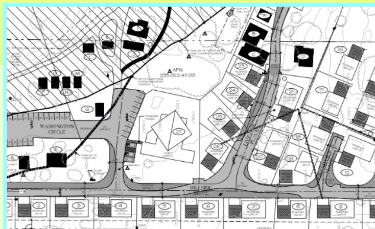
Partial plot plan of HGSA rebuild areas, looking toward Escondido Creek. Black buildings survived the Cocos Fire; Building R is the Healing Temple. Building #27 is the new church.

Fund-raising efforts are set to begin in earnest.